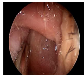
Figure 1: Nasal polyps filling the nasal cavity, note the suction to the left and nasal hair to the right.

He may not be “cured” from his sinus polyps, but he is on the road to maintaining a substantial reduction in his symptoms and significantly improving the quality of his life.