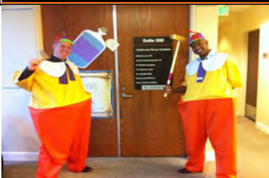
Tweedle Dee and Tweedle Dum!

Every year we get the chance to go crazy for a day at work (well some days it feels like we are always going crazy ?)